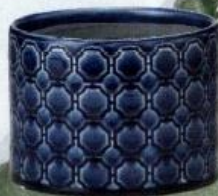
Cara planter, R79, Volpes