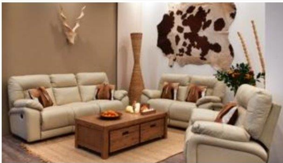
Many of today's newly built homes, space is often at a premium – especially for those living in clusters.

They are particularly exciting to me, as I believe that unlike many décor trends of the past, the majority of them will also offer great longevity of style." She offers the following summary of what's trending in the design world at the moment: